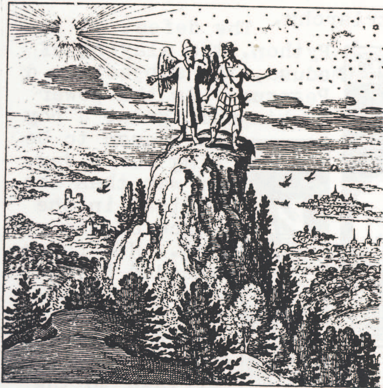
90. The king's son and his guide on top of the paternal phallus inside the womb.

Rise of Xtianity. Jesus referred to as "King of Kings"